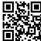
Dar Al Muharraq